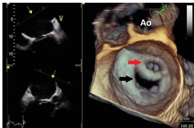
Figure 2. Real-time 3D transesophageal echocardiography, "surgical view", showing the dehiscence and anterior migration of the surgical mitral ring (red arrow). Note the dilation of the native mitral annulus and the orifice created posterior to the surgical ring (black arrow). Ao – aorta.

rior migration. Therefore, a double orifice was created between the LA and the LV: one anteriorly, through the surgical ring, and the other one posterior to the surgical ring (Figure 2). Forward transmitral diastolic flow was visible through both orifices (Figure 3A). The