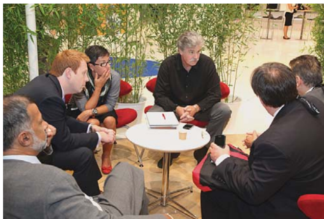
Figure 2. Round table discussions at ESC.

may include presentations in one room on heart failure and in an adjacent room on heart rhythm disturbances. Through the village concept the congress becomes more manageable and interactive. Important new guidelines will be presented at the ESC Congress 2013 on arterial hypertension, cardiac pacing, diabetes, and stable coronary artery disease. Linked to these will be dedicated scientific sessions, case based Focus Sessions.