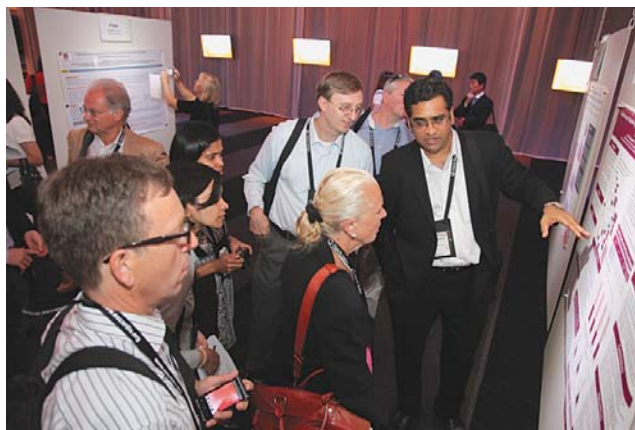
Figure 1. Discussions around a poster at ESC Congress.

There is huge and international enthusiasm for participation in the congress with a record number of submissions for scientific planned sessions (more than 400 were selected) and the second highest ever number of abstracts were submitted (10,490). To make the congress more manageable we have again arranged the congress into “villages” of related topics. Thus, a village