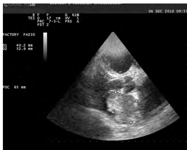
Figure 1. Transthoracic echocardiography (parasternal long-axis view) showed a huge left atrial mass (5,3 cm×4 cm) attached to the atrial septum protruding into the left ventricle during diastole.

dilated, with supple leaflets; moreover, with surprise, a major regurgitation was detected after saline injection. Mitral annuloplasty was done using a 28 Edwards Cosgrove annular band with trivial residual regurgitation. Aorta was unclamped and the heart restarts promptly its activity in sinus rhythm. The ECC was stopped under inotropic support. The anatomic-pathological exam confirmed that the tumor was a myxoma. At the follow up, 6 weeks after the operation, the patient was doing well and an echocardiographic Doppler examination showed a drop of the systolic pulmonary artery pressure at 43 mmHg.