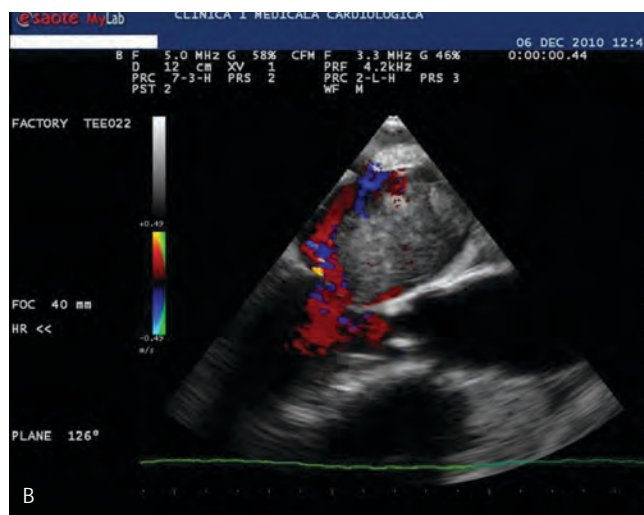
Figure 2. Two-dimensional transesophageal echocardiographic image, mid-esophageal view at: A. 126 degree demonstrates the large atrial mass (M) protruding into the left ventricle during diastole and B. 126 degree, showing a large (5 cm×3.5 cm), ovoid and heterogeneous mass (M) in the left atrium surrounded by the color Doppler flow.

ses. Left ventricular inflow tract obstruction because of the myxoma can mimic a mitral stenosis and can be a cause of pulmonary hypertension and congestive heart failure 2 . Common systemic symptoms are: fever, malaise, weight loss, fatigue, anaemia, elevated erythrocyte sedimentation rate (ESR). Both symptoms and signs resolve immediately after surgery and seems to be due by the releasing of inflammatory mediators from tumour cells 1,2 . Myxomas are of two types: one with round, nonmobile surface and other polypoid type with irregular surface, mobile with an increased risk of embolisation 2,11 . Surgical removal is the treatment of choice for myxomas. The site of the attachment should be resected with clear margin, even if that is followed by the artificial creation of an atrial septal defect that needs to be closed by a pericardial patch 4,7-11 . The recurrence-